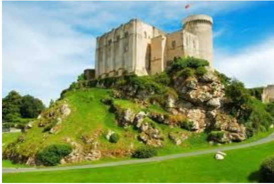
Chateau de Falaise