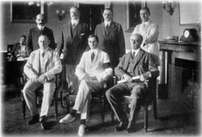
The Federal Reserve Board as they took office on August 10, 1914. From left to right, standing: Paul M. Warburg, John Skelton Williams (Comptroller of the Currency), W.P.G. Harding, Adolph C. Miller; Seated: Charles S. Hamlin (Governor), William G. McAdoo (Chairman), and Frederic A. Delano. McAdoo is wearing a mourning armband to commemorate the death, four days earlier, of his mother-in-law, Ellen Axson Wilson.