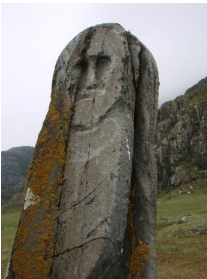
Left: A figure of Scythian man cut in stone - Turkey