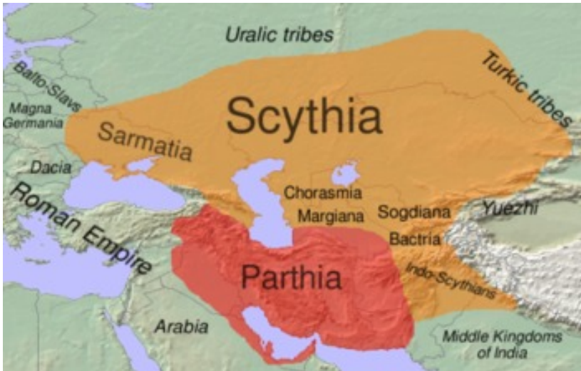
Above: Map showing the location of Scythia.